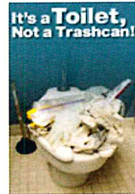
It's a Toilet, Not a Trashcan Bill Stuffer (Pack of 100)