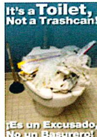
It's a Toilet, Not a Trashcan Bill Stuffer - Bilingual Spanish